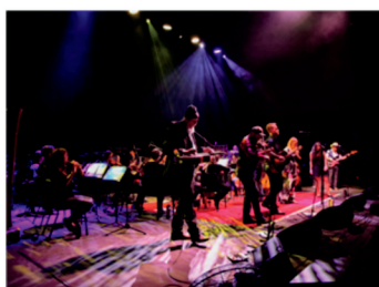
CSO and Ten Cent Stranger at Symphony Underground Jan 20, 2023