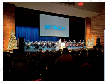
Home Alone in Concert Dec 9 & 10, 2022