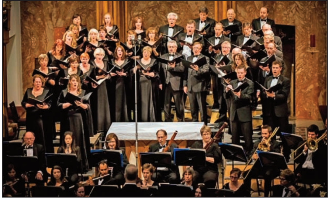
The Cheyenne Chamber Singers will join the CSO in its performance of Handel's Messiah on Sat., March 19. The concert is scheduled for 7:30 pm at the Cheyenne Civic Center. Admission is free, but tickets are required for entry. To reserve seats, call the CSO at 307-778-8561 or e-mail us at messiah@cheyennesymphony.org . Please include how many seats you would like and your phone number.

Students and their families receive vouchers to attend the concert at no cost, thanks to individuals and companies that support CSO's educational programs.